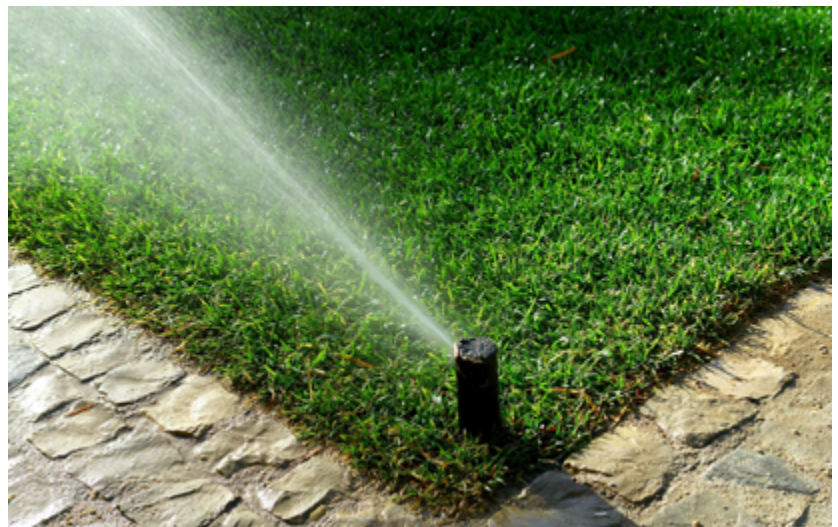
Ensure that irrigation heads are directed at turfgrass, not sidewalks or other impervious surfaces.