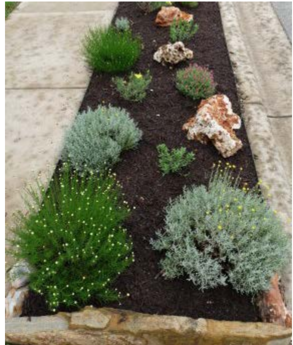
A narrow strip of turf is a struggle to maintain and leads to significant quantities of water runoff (above). Replacing turf with drought tolerant plants in these narrow strips creates a landscape bed that requires reduced labor and no supplemental irrigation once established (right).