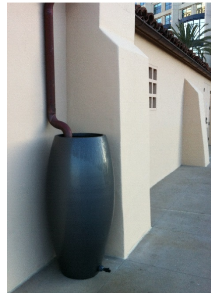
Rain barrels can be used to collect rainwater for use on turf and landscape plants.