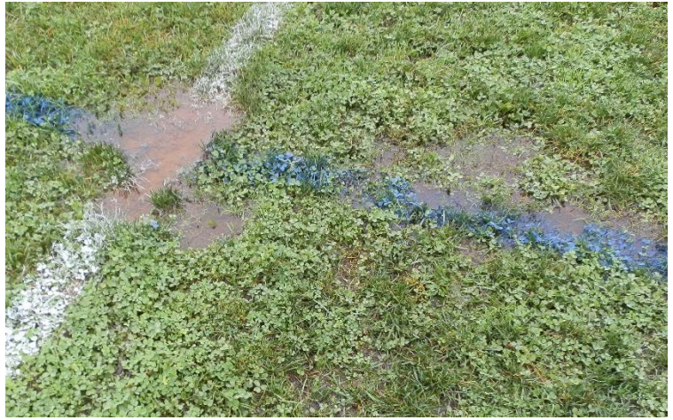
Pooling of water can occur when soil infiltration rates are slower than water application rates.

Recognize conditions that contribute to poor infiltration , such as poor soil structure, compacted soil, or excess thatch at the soil and turfgrass interface. The rate of infiltration into the soil will be influenced by the soil type and texture. Soils with a high percentage of clay have poor infiltration rates, below the typical rate of irrigation application (0.3 to 0.6 inches per hour). Frequently, irrigation applied to a heavy clay or compacted soil will lead to puddling, runoff, and leaching. Maximize the amount of water entering the root zone, which allows uptake and storage of the water, by reducing leaching (water movement below the root zone):