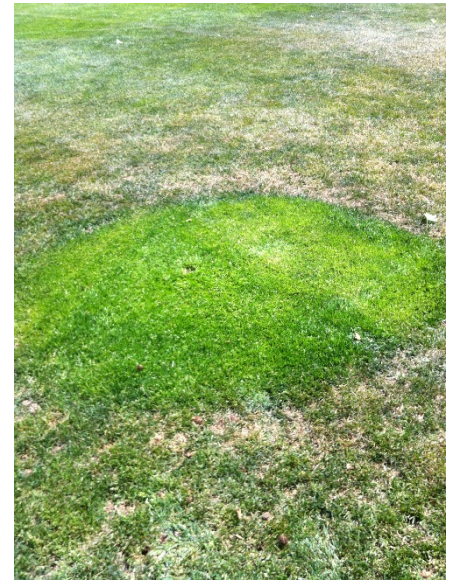
Evidence of a problematic irrigation head.